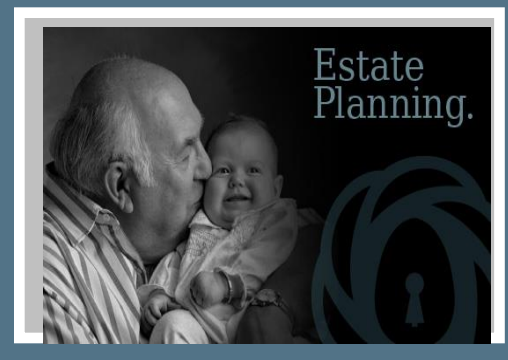
Protecting What You Value Most Through Estate Planning and Asset Protection