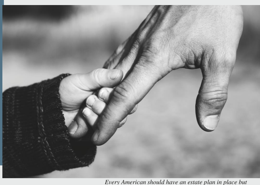
Every American should have an estate plan in place bu the need for comprehensive estate planning is even greater when you have children.

by a professional South Florida estate planning attorney who is familiar with the goals you wish to accomplish for your family. Your legal eagle