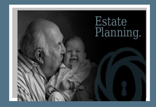
Protecting What You Value Most Through Estate Planning and Asset Protection