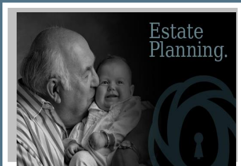
Protecting What You Value Most Through Estate Planning and Asset Protection