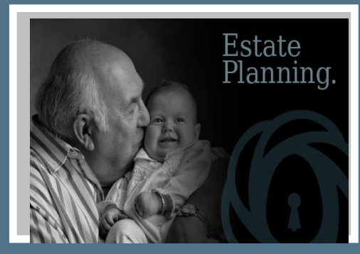
Protecting What You Value Most Through Estate Planning and Asset Protection