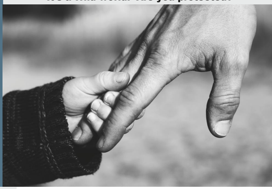
Every American should have an estate plan in place but the need for comprehensive estate planning is even greater when you have children.

payments that are invested to create tax exempt income; you can also use it as a strategy to decrease your gross estate, and avoid gift and estate taxes.