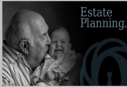
Protecting What You Value Most Through Estate Planning and Asset Protection