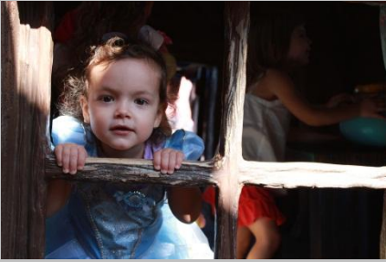
Protecting What You Value Most Through Estate Planning and Asset Protection