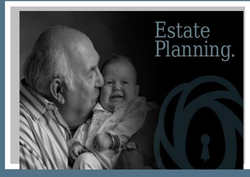
Protecting What You Value Most Through Estate Planning and Asset Protection