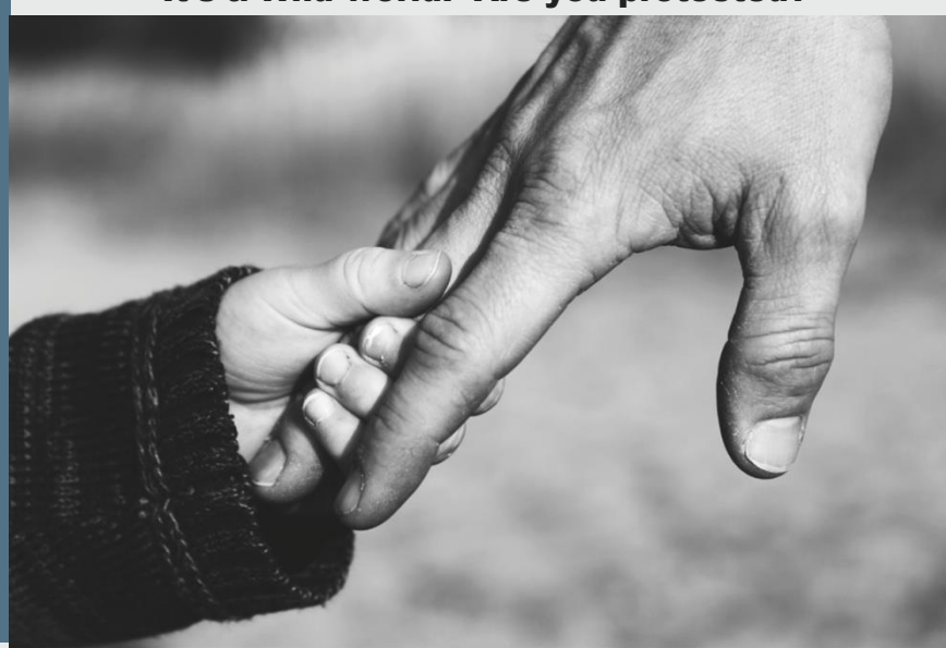
Every American should have an estate plan in place but the need for comprehensive estate planning is even greater when you have children.