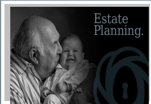
Protecting What You Value Most Through Estate Planning and Asset Protection