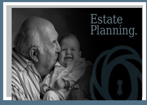
Protecting What You Value Most Through Estate Planning and Asset Protection