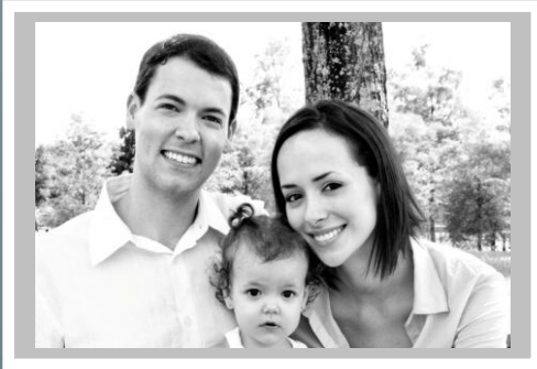
Protecting What You Value Most Through Estate Planning and Asset Protection